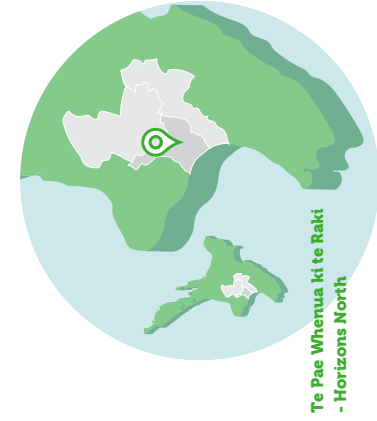
Te Pae Whenua ki te Raki - Horizons North