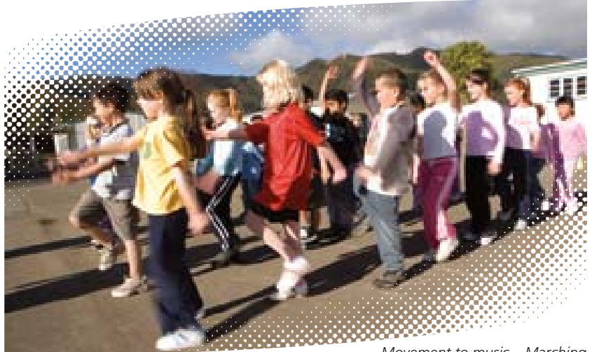
Movement to music – Marching

Repeat the walking pattern several times then add an arm combination.